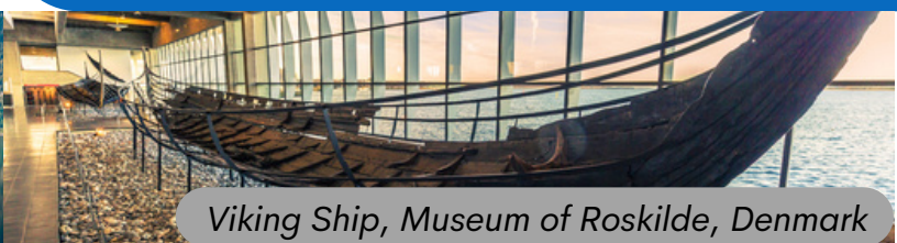
Viking Ship, Museum of Roskilde, Denmark

cara@206tours.com sylvia@206tours.com (800) 206-8687