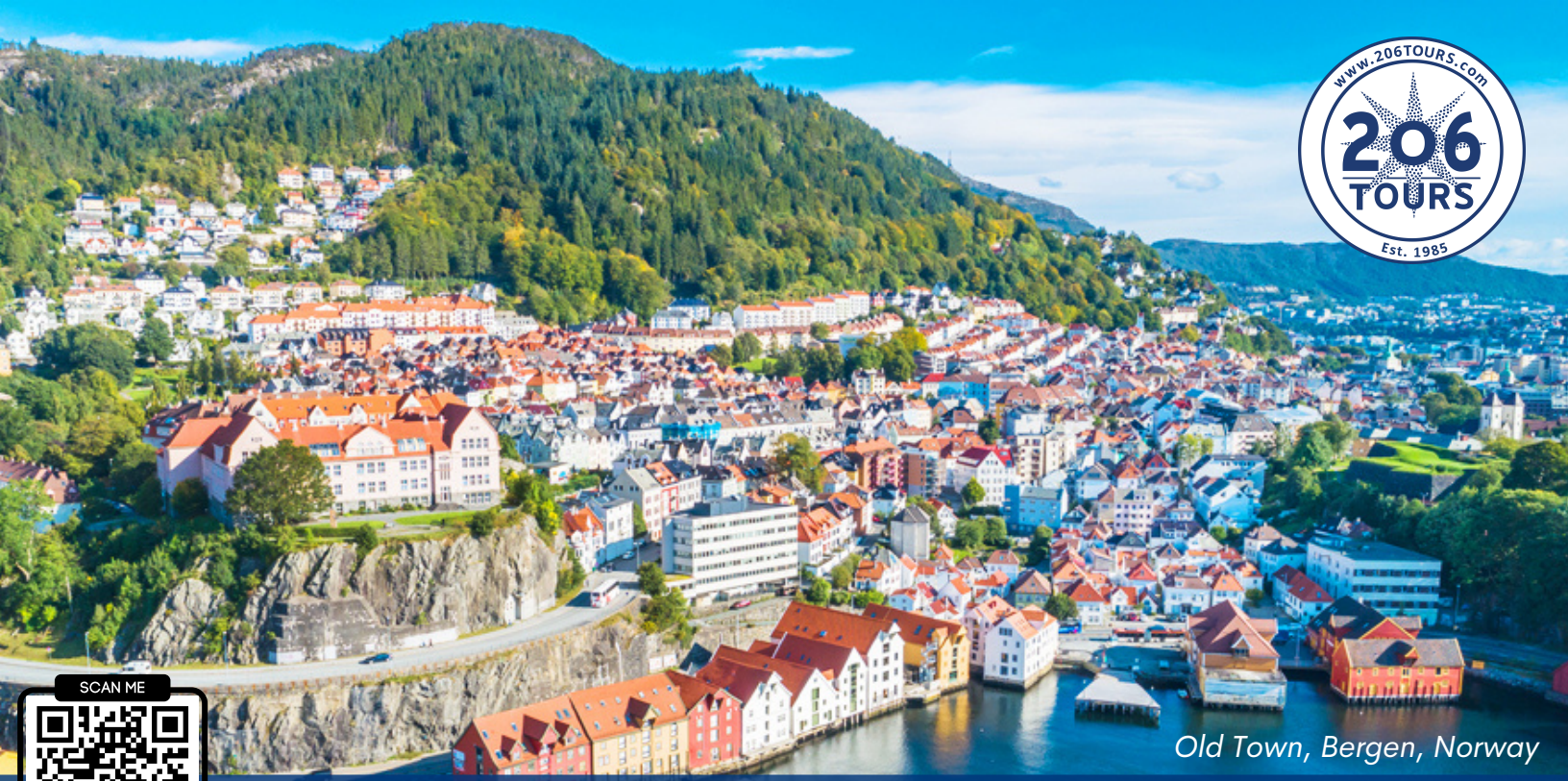
Old Town, Bergen, Norway