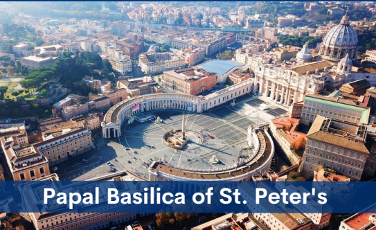
Papal Basilica of St. Peter's